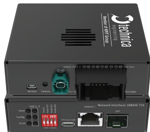
Network Interfacer 10BASE-T1S

For more complex setups, users can access a comprehensive set of features through the device's web-based GUI. This interface allows configuration of advanced parameters, such as Node ID roles (coordinator or follower), node count, transmit opportunity, burst mode, and bus termination for optimized network performance. Additionally, traffic monitoring, port mirroring, and Multi-node Injector and Switch modes further enhance its capabilities for analysis and troubleshooting in complex networks.