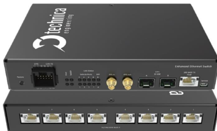
Enhanced Ethernet Switch RJ-45

The EES RJ-45 provides a reliable gPTP/802.1AS-2011 automotive profile stack which is also compatible with 802.1AS-2020. In addition, the stack partially includes the IEEE 1588-2008 standard for time synchronization that allows various customization possibilities to adapt to many customers use cases