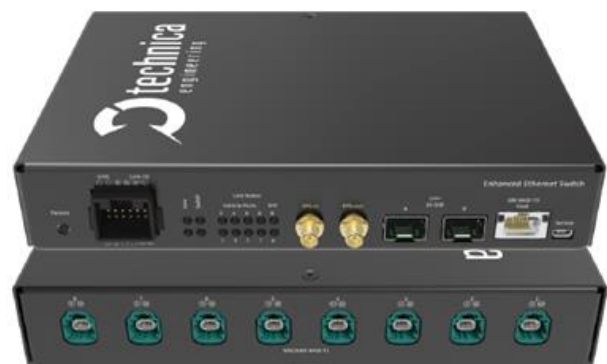
Enhanced Ethernet Switch MACsec H-MTD