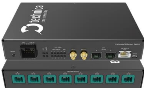
Enhanced Ethernet Switch MACsec MATEnet

The EES MACsec provides a reliable gPTP/802.1AS-2011 automotive profile stack which is also compatible with 802.1AS-2020. In addition, the stack partially includes the IEEE 1588-2008 standard for time synchronization that allows various customization possibilities to adapt to many customer use cases.