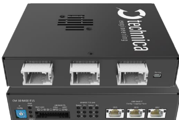
CAPTURE MODULE 10BASE-T1S

The CM offers a flexible and user-friendly configuration through its built-in web server. The device webpage can be easily accessed via a standard web browser. In addition, the possibility to import/export a configuration makes it even more convenient.