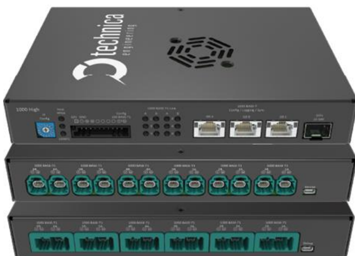
Capture Module 1000High

The CM offers a flexible and user-friendly configuration through its built-in web server. The device webpage can be easily accessed via a standard web browser. In addition, the possibility to import/export a configuration makes it even more convenient.