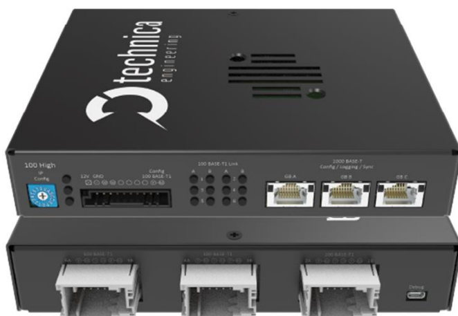
Capture Module 100High

The CM offers a flexible and user-friendly configuration through its built-in web server. The device webpage can be easily accessed via a standard web browser. In addition, the possibility to import/export a configuration makes it even more convenient.