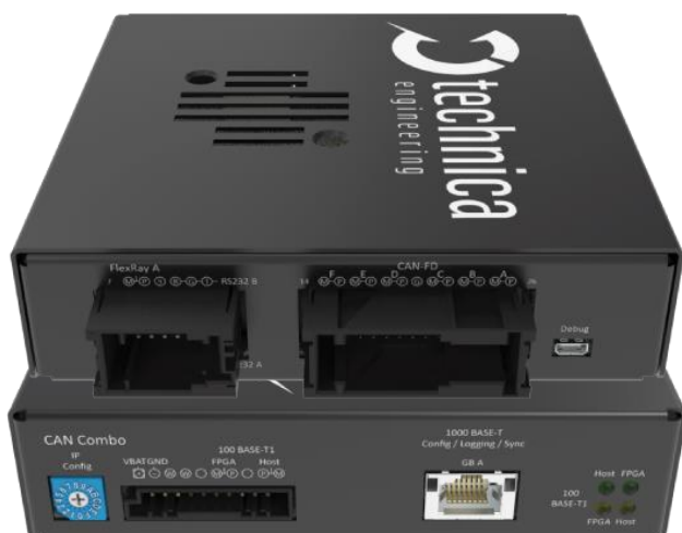
Capture Module CAN Combo

The CM offers a flexible and user-friendly configuration through its built-in web server. The device webpage can be easily accessed via a standard web browser. In addition, the possibility to import/export a configuration makes it even more convenient.