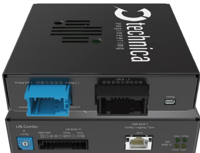
Capture Module LIN Combo

The CM offers a flexible and user-friendly configuration through its built-in web server. The device webpage can be easily accessed via a standard web browser. In addition, the possibility to import/export a configuration makes it even more convenient.